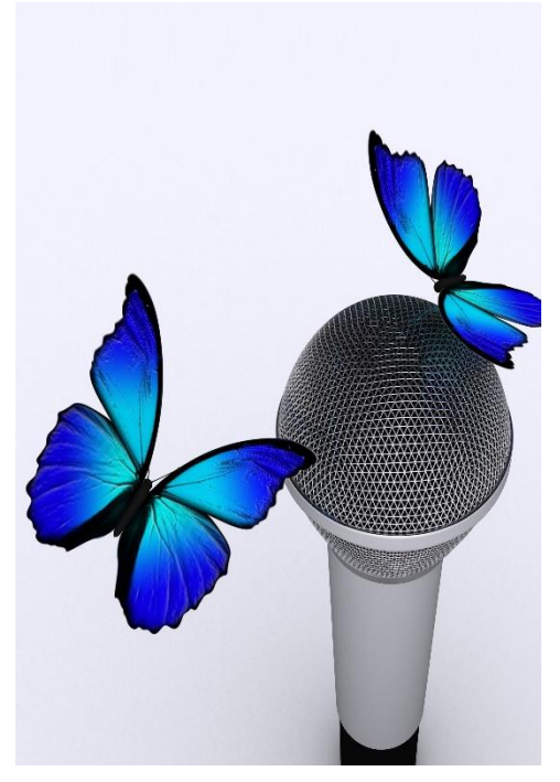
The Confident Presenter Speak with Confidence & Impact Engage your audience, without the nerves.