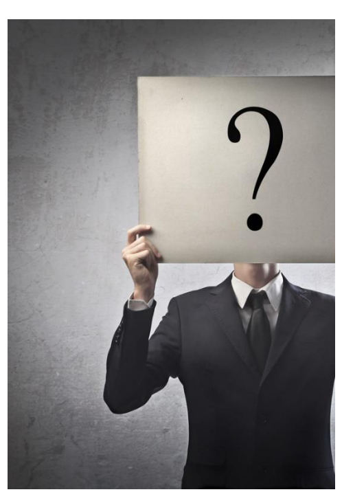
The People Magnet Understand Self and Others Build stronger relationships with Colleagues and Clients.

Further information on each topic is available on request.